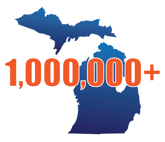
Over 1 Million Michiganders are already protected by Smart911.